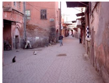
Passage on the left under the sign Musée Dar Si Said