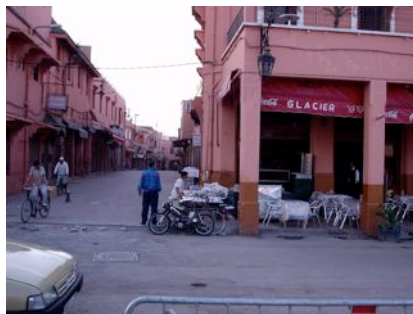
Café de France on the right.

Dar Allaimoune is in the southern part of the old Medina, 500m south-east of La Place Jemaa-el-Fna, the focus of Marrakchi entertainment with musicians, fortunetellers, snakecharmers and cafés. From La Place take the street between the Café de France and Restaurant Marrakchi on the east side of the square. Walk down Rue Riad Zitoun Jdid. After 400m turn left down a covered passageway following signs to Dar Si Said.